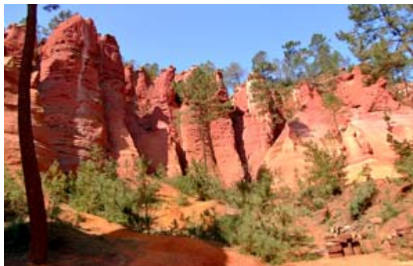
Ochre at the old quarries