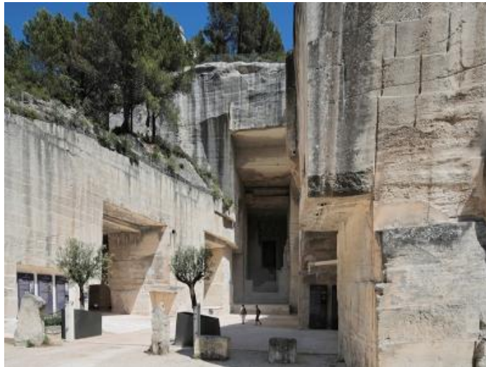
Entrance to the quarry

Later, we will discover the “Carrières Lumière”, a quarry turned into a gigantic 3-D canvas. The current art show features works by Leonardo, Michelangelo and Raphael.